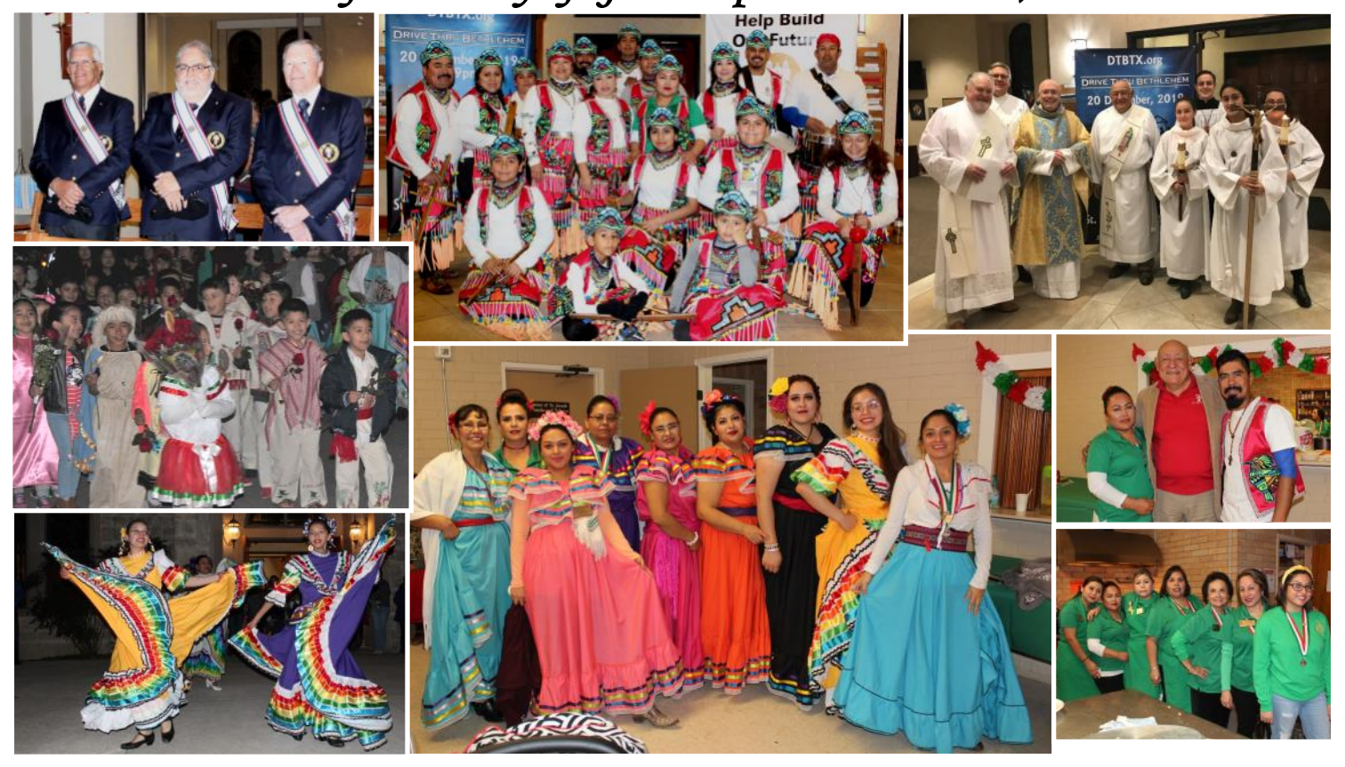
Parish Christmas Party - December 13, 2019